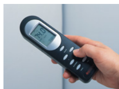
FireGenie® RF remote control