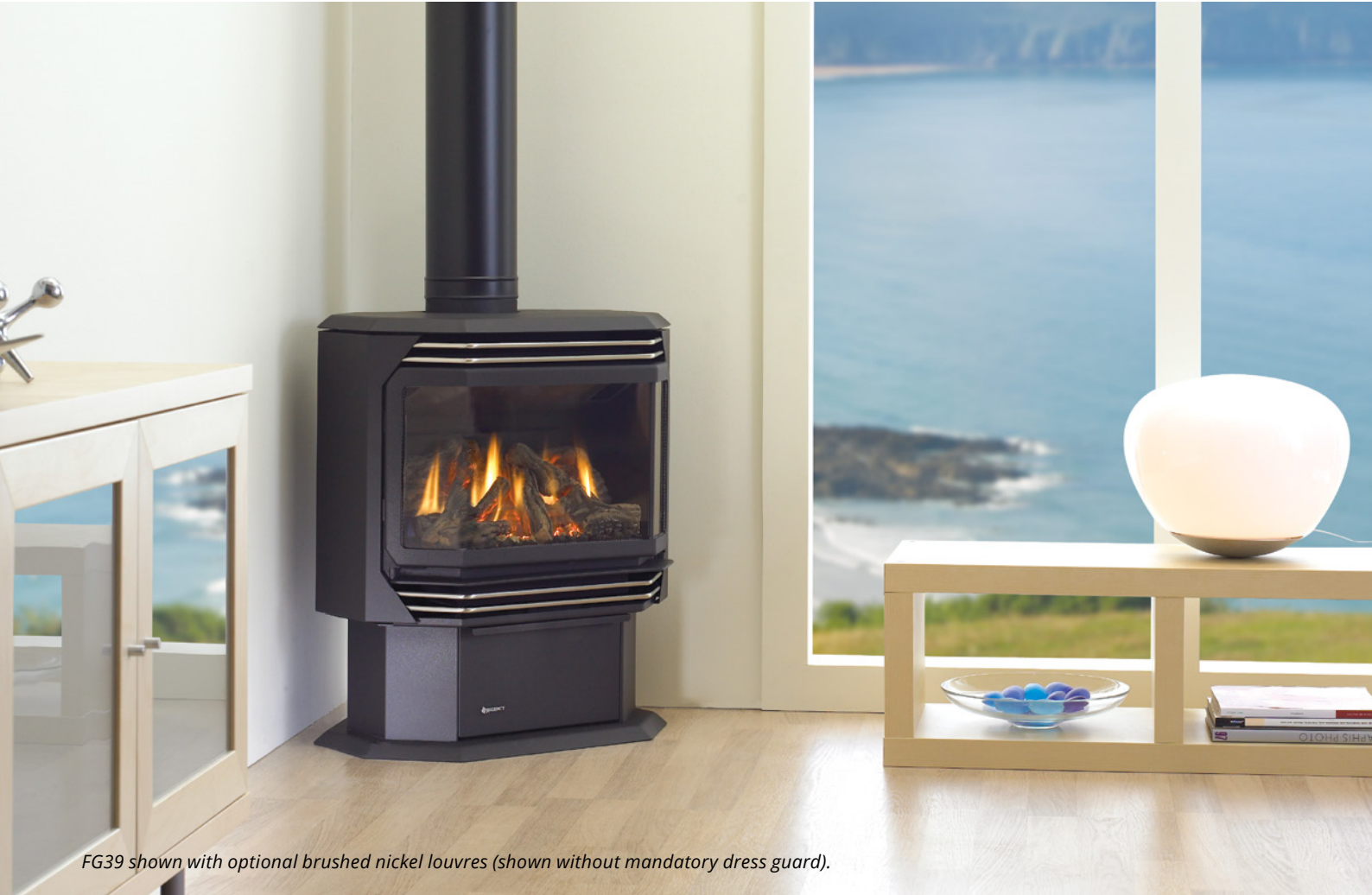
FG39 shown with optional brushed nickel louvres (shown without mandatory dress guard).

This Regency gas log fire features the finest, most realistic flame picture available. Enjoy the exceptional view through the wide one piece glass door designed to showcase the glowing flames and embers. With room sealed direct vent technology, you can vent up and out of your home saving money on complicated installations.